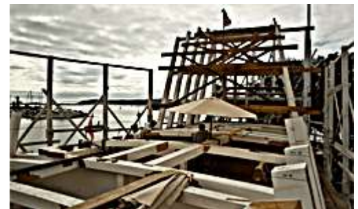
The rising sterncastle, deck beams and stringers of the San Salvador's main deck.

Ships are what historians of technology call superartifacts. Because of their complexity and the sense of identity they inspire, they have the unique ability, perhaps beyond any other human creations, to evoke the entire worlds that once formed their context. Ironically, in a present age of instantaneous communication and 24-hour news cycles, it becomes ever more difficult to travel to the past for understanding about how our world emerged from the outcomes, some incredibly unlikely, of past events. For that very reason it also becomes ever more difficult to plot a course forward into the future. Winston Churchill once said, when asked how far into the future it was possible to see, "that it depends entirely on how far back into the past you can look." With San Salvador , we will be able to look a long way back indeed. Thank you for helping to start the voyage.