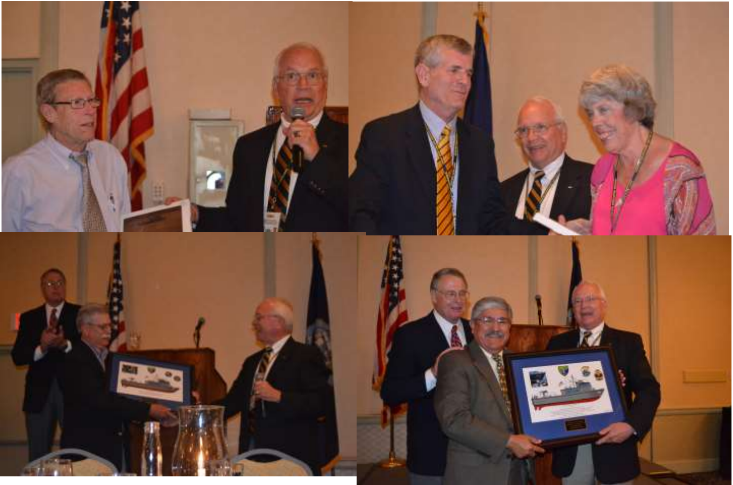
Still on Patrol Ceremony at the Memorial